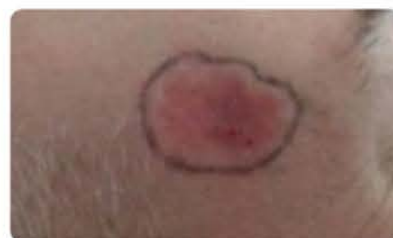
Lesion area to be treated