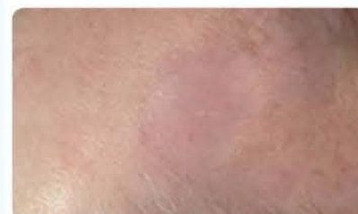
Healing process 30 – 180 days