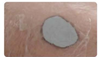
Application of Rhenium-SCT, treatment time 45 – 180 min